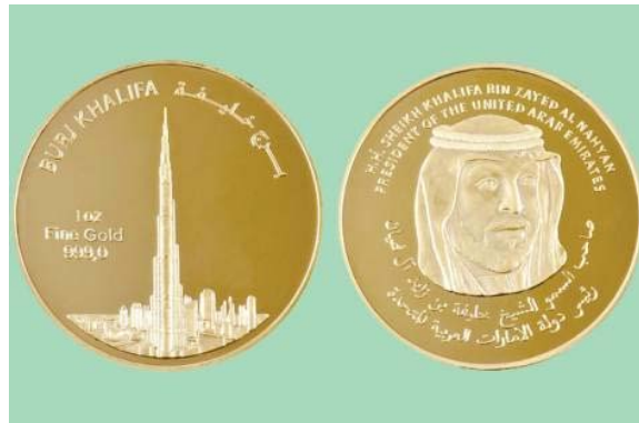
Proposed khalifa coin, intended to serve as legal currency in the Gulf States region.

Governments of the Gulf States have discussed a common currency tentatively named the khaleeji, which some have speculated would be based on gold. In August 2011, the Dubai Multi Commodities Center introduced a gold coin, called the khalifa, intended to serve as legal currency. The DMCC is in talks with the central bank of the UAE to designate the coin as legal tender throughout the UAE and Middle East.