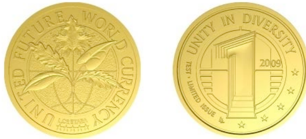
The coin held by President Medvedev.

At a G8 meeting in July 2009, Russian President Dmitry Medvedev illustrated his call for a supranational currency to replace the dollar with a coin that he called a sample of a “united future world currency.” The coin is half-ounce gold bullion coin. Such a “supranational currency” would be, in effect, a parallel currency, used alongside national currencies.