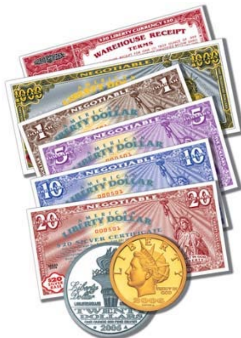
Liberty Dollar notes and coins.

Although the use of other countries' national currencies is largely accepted in the U.S., the issuance of alternative currencies within the U.S. can run afoul of what are collectively known as "legal tender laws," both de jure and de facto . Beginning in 1998, a private businessman, Bernard von NotHaus, issued a system of coinage and paper bills called Liberty Dollars that represented warehouse receipts for gold and silver bullion. The notes and coins bore no resemblance Federal Reserve Notes or U.S. Mint coins. About 250,000 people apparently participated in the system. Although other alternative currencies have existed, such as "Phoenix dollars," Baltimore's "BNote," "BerkShares," "Ithaca Hours," and "bitcoin," this was apparently the only such system based on gold and silver.